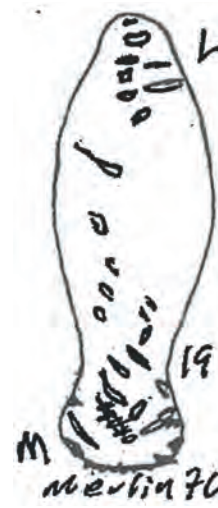
Merlin BS19 (1970) Large Male