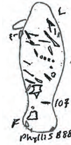
Phyllis BS107 (1988) Large Female