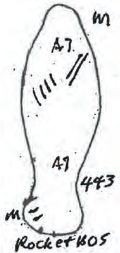
Rocket BS443 Born 2005 Medium Male