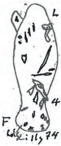
Lily BS04 (1974) Large Female