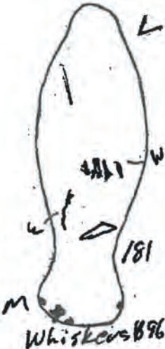
Whiskers BS181 (Born 1996) Large Male

Save the Manatee Club thanks the Florida Department of Environmental Protection's Division of Recreation and Parks, with special thanks to the staff and management at Blue Spring State Park.