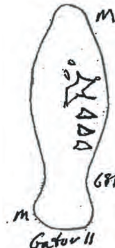
Name: Gator ID: BS681 First ID'd: (2011) Size: Medium Male