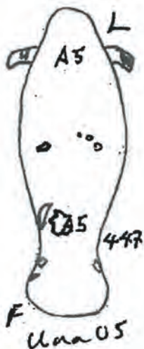
Una BS447 (2005) Large Female