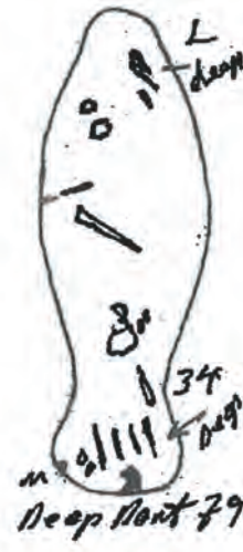
Name: Deep Dent ID: BS34 First ID'd: (1979) Size: Large Male