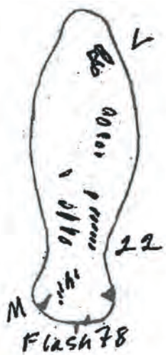
Name: Flash ID: BS22 First ID'd: (1978) Size: Large Male