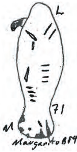
Margarito BS34 (Born 1984) Large Male