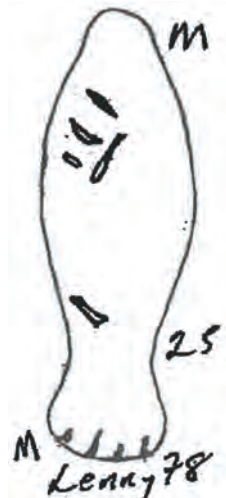
Name: Lenny ID: BS25 First ID'd: (Born 1978) Size: Medium Male