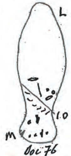
Name: Doc ID: BS10 First ID'd: (1976) Size: Large Male