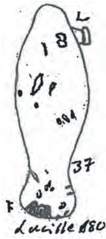
Lucille BS37 (Born 1980) Large Female