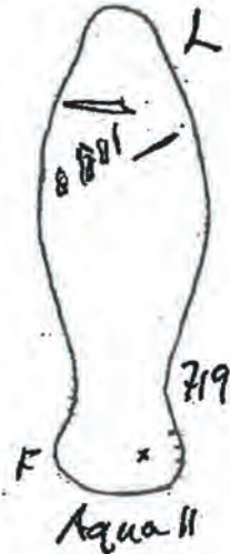
Name: Aqua ID: BS719 First ID'd: (2011) Size: Large Female