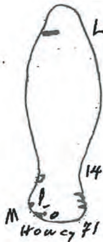
Name: Howey ID: BS14 First ID'd: (1971) Size: Large Male