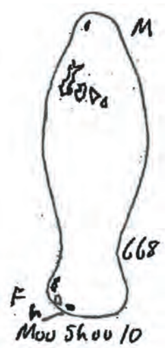
Moo Shoo BS668 (2010) Medium Female