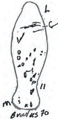
Name: Brutus ID: BS11 First ID'd: (1970) Size: Large Male