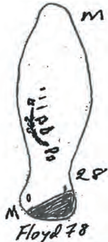
Name: Floyd ID: BS28 First ID'd: (1978) Size: Medium Male