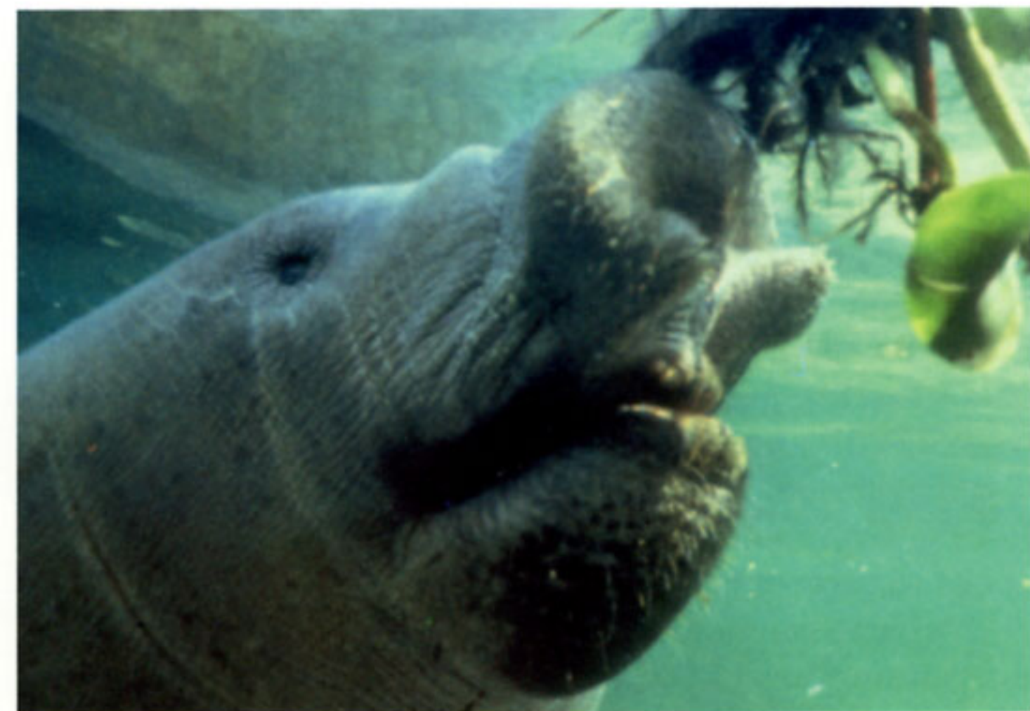
Manatees have a flexible upper lip with stiff bristles that help draw food to the mouth.